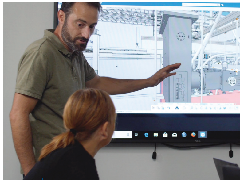
Top image: ESS workers checking installation sequencing virtually.